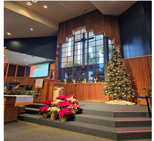
Sanctuary during Advent

Our campus also boasts a Chapel, Library, Education/Multi-Purpose Rooms and Playground. As you walk our grounds, you see our beautiful Biblical Gardens, Columbarium and of course our majestic Carillon Tower.