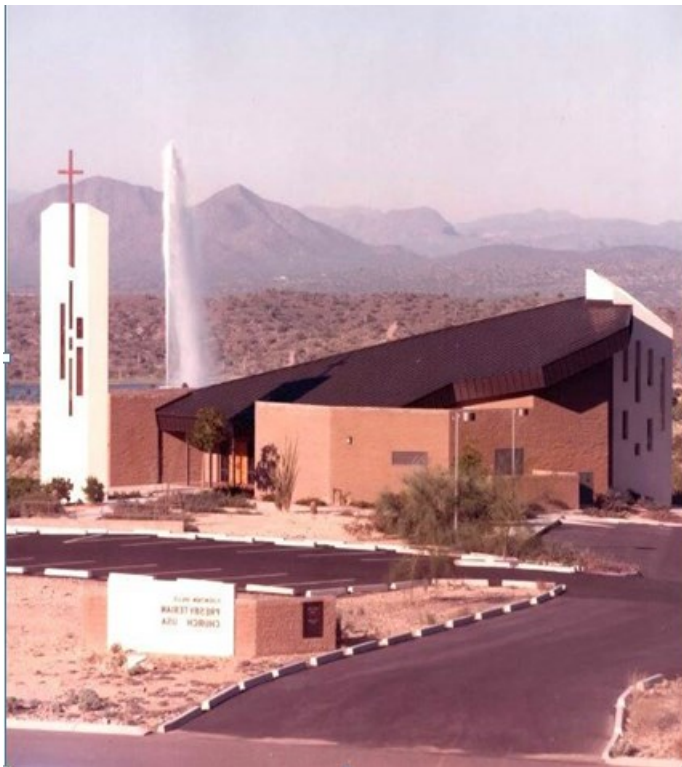
FHPC Campus with Fountain in the Background

Construction of the sanctuary began in March 1983. The first worship celebration in the new sanctuary was held on December 18, 1983. In 1989, a Program Center and Columbarium were dedicated, and the carillon system was installed in the Memorial Tower. In July 2004, construction of the Fellowship Center, including a kitchen and additional classrooms, was completed. Throughout FHPC's history, it has benefited from generous and talented members for its growth and financial stability, which continues to this day.