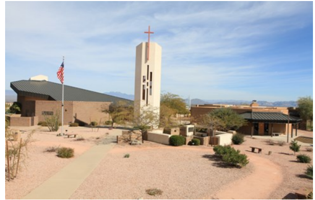
Fountain Hills Presbyterian Church

While the town of Fountain Hills, with its excellent school system, is an ideal place for families to raise their children, the town is also a strong attraction to those opting for early retirement. Therefore, a large portion of our target audience are those entering their retirement years. We need and desire to reach young families with children, but our greatest success to date has been with those recently retired.