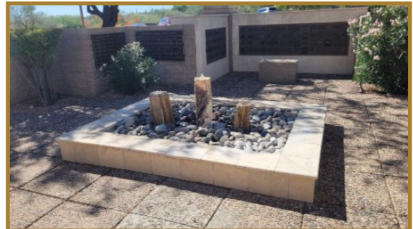
Columbarium & Fountain